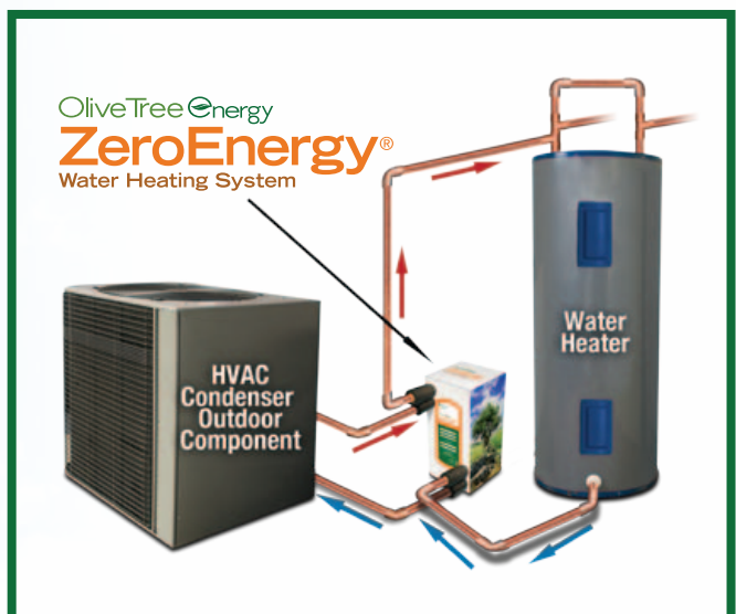
How the ZeroEnergy® Water Heating System works.